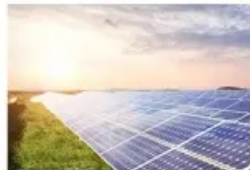
Energy Storage System