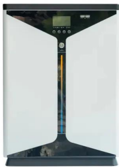
ABB central inverters PVS800 - 500 to 1000 kW

ABB central inverter software includes all the latest grid support and monitoring features including active power limitation, low voltage ride through 500 kW 630 kW 875 kW 1000 kW Maximum output power 2) 600 kW 700 kW 1050 kW 1200 kW Power at cosj = 0.95 1) 475 kW 600 kW 830 kW 950 kW Nominal AC current (I